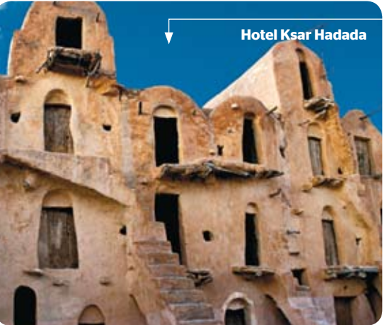
Hotel Ksar Hadada