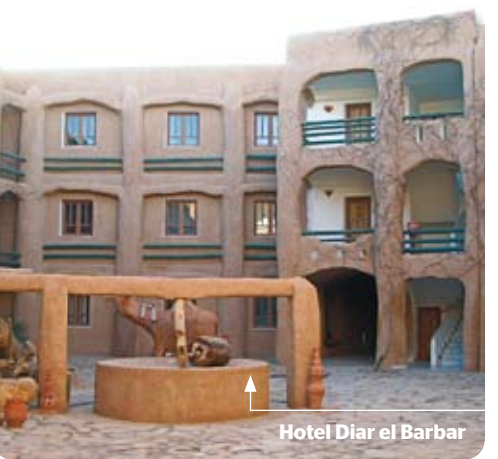
Hotel Diar el Barbar