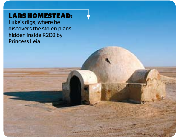
LARS HOMESTEAD: Luke's digs, where he discovers the stolen plans hidden inside R2D2 by Princess Leia.

Currency: Dhs10 = 3.7 Dinar Language: French or Arabic