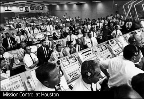
Mission Control at Houston