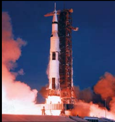
The Saturn V blasts off