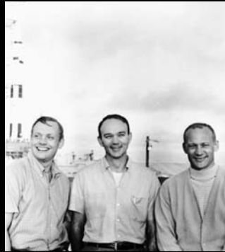
Apollo 11 astronauts with Saturn V