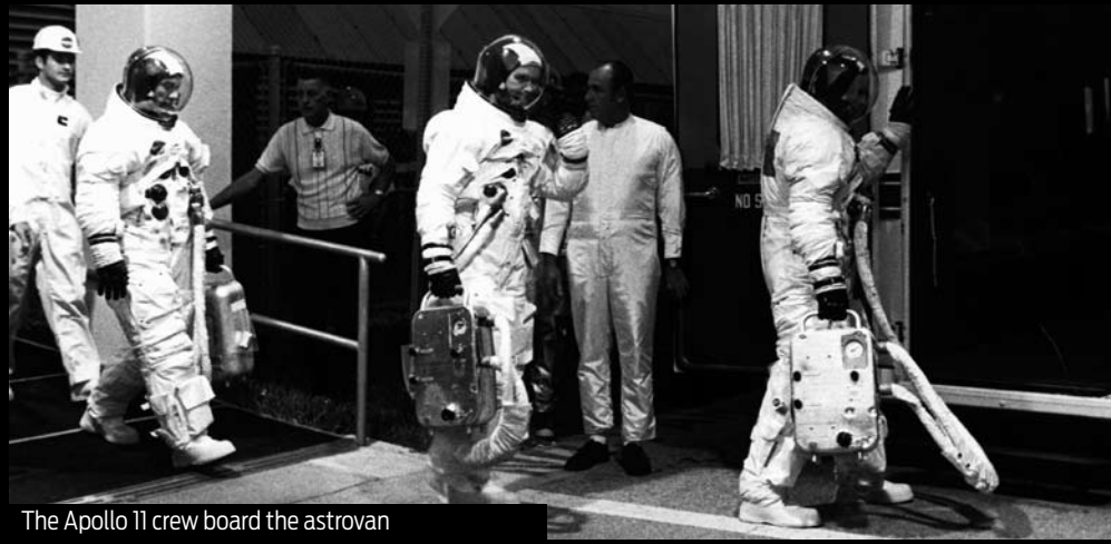
The Apollo 11 crew board the astrovan