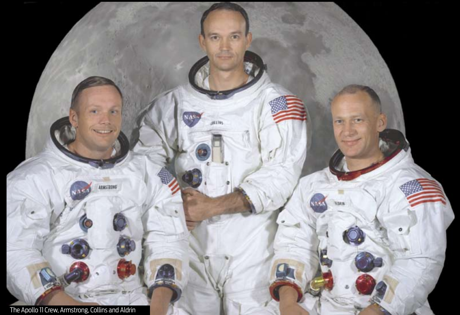
The Apollo 11 Crew, Armstrong, Collins and Aldrin

spell disaster. This placed everyone, from the most junior team member to the Flight Director himself, under immense stress.