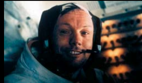
Neil Armstrong in the lunar module