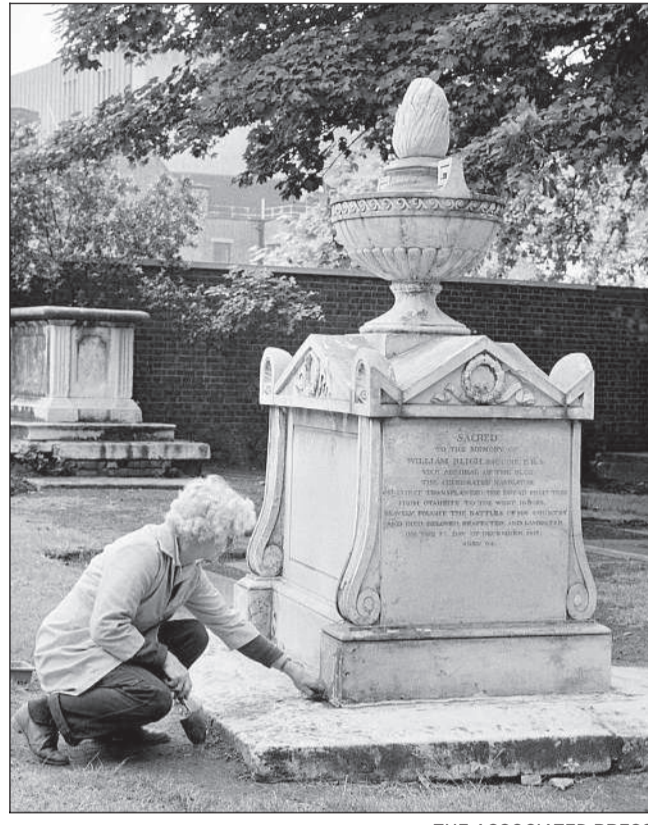
A gardener cleans up the tomb of Capt. William Bligh in the graveyard of St. Mary-at-Lambeth Church.

A single doorway with minimal signage marks the entrance, and this is immediately on the left as you slowly step through the hotel's giant revolving doors. It's likely you'll miss it on the first few attempts. A short descending staircase opens to reveal a sizable bar and dining area deliciously decorated in Polynesian-style patterns, bamboo and ti leaf thatch.