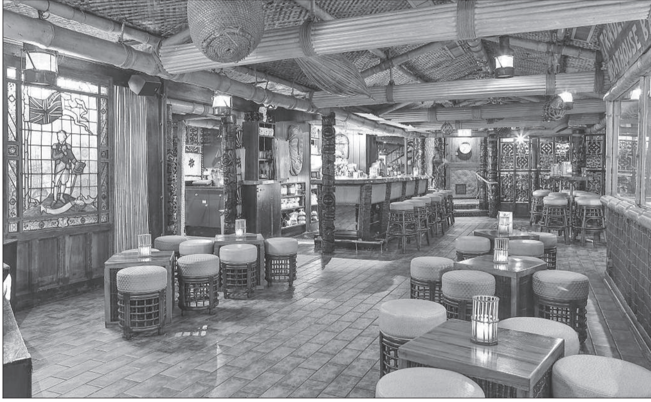
The home of the Mai Tai is the popular Hawaiian-style haunt Trader Vic's in the Park Lane Hilton hotel.

Tucked away down a cobble lane next to Carnaby